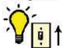
turn lights on