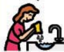
wash my face